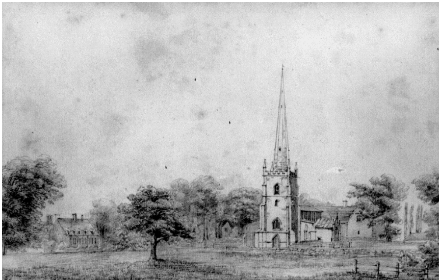
A view of the church from the west c. 1840

Notwithstanding this setback a major repair project was completed which included a lightning conductor, new weathercock, and extensive repairs to the stonework.